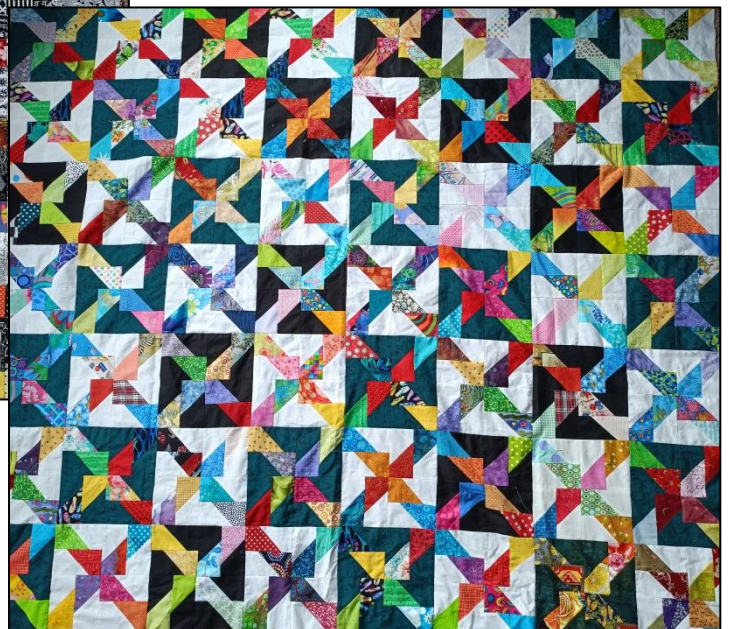
Below: Jagged X