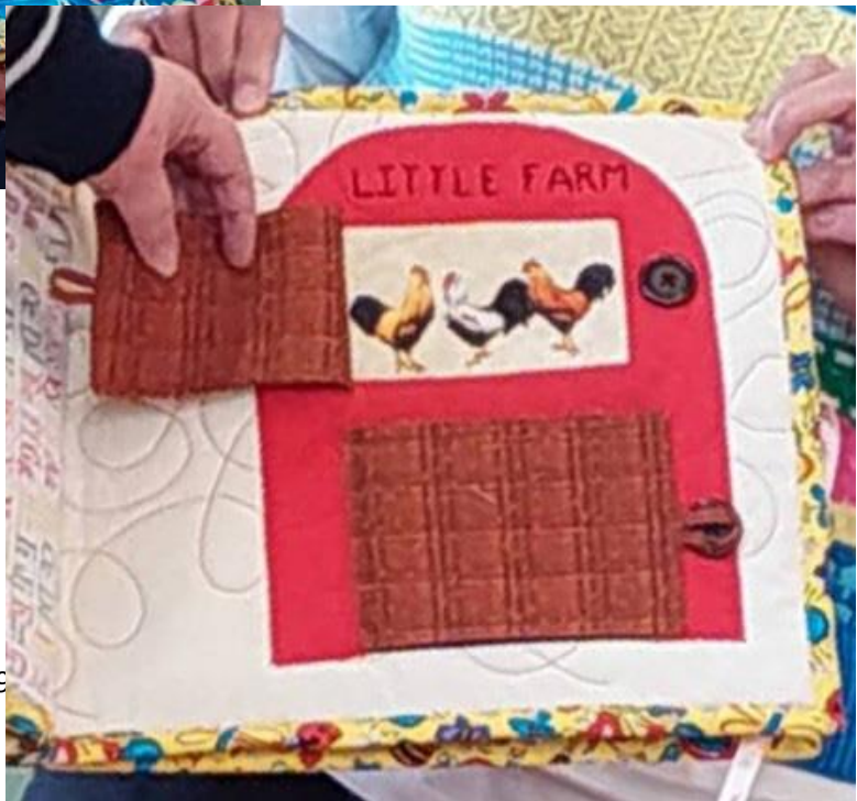
Alison' Activity BookT