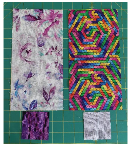
New Flip Flop Block