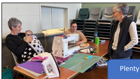
Plenty of time for cuddles!