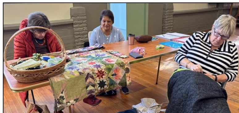
Hard at work